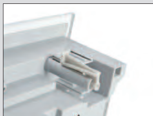
Accessories for hollow mounting.