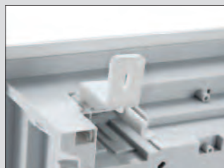
Accessories for flush mounting included.