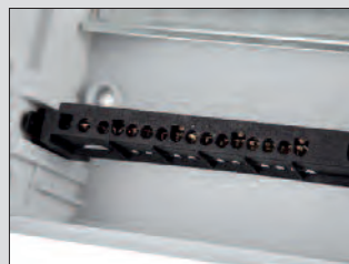
Terminal blocks (2x16mm 2 + 14x10mm 2 ) included.