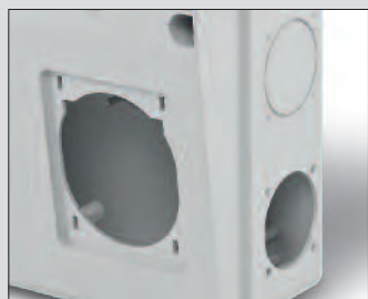
Left and right side knockouts for DOMO Series (flange 50x60mm).