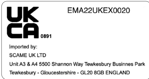
Figure 1- Example of marking Label