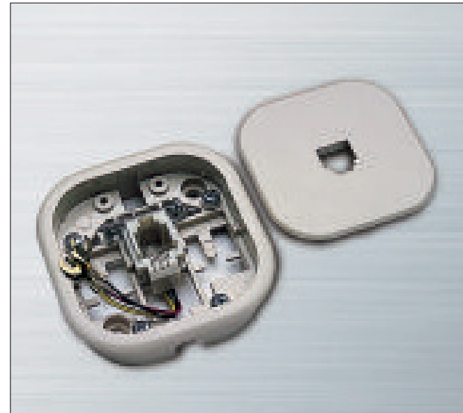
Surface and flush mounting RJ socket 6/4

For the qualified installer, Scame is offering a series of products that will satisfy most of the common needs both for wiring up and for expanding a telephone installation.