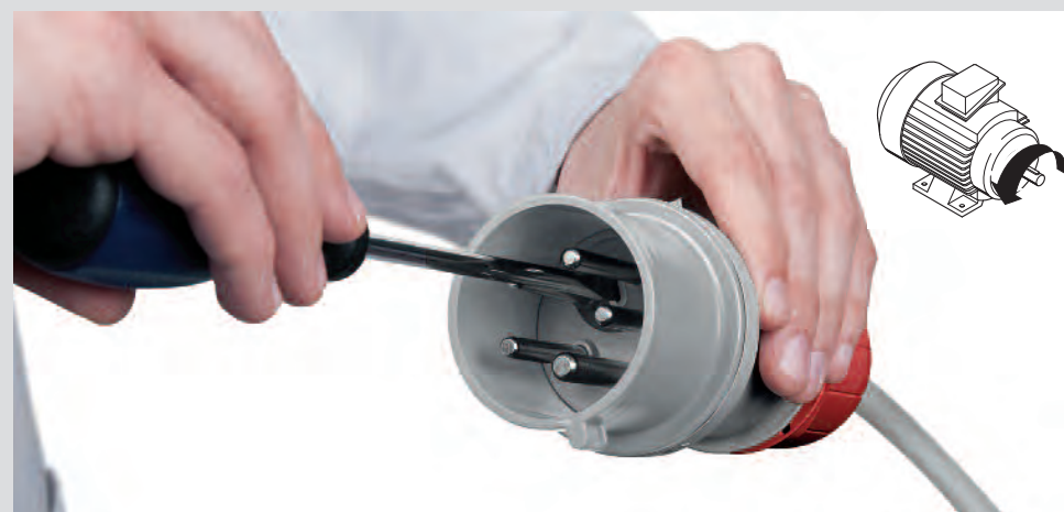
The phases are inverted by simply pushing and turning the phase pin support with a screwdriver.