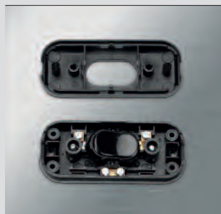
Slide in-line switch, with neutral connection for flat cable.