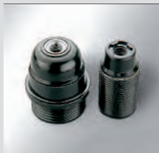
Thermoset lampholders: left, with E27 coupling, partly threaded skirt and metal nipple; right, with E14 coupling, fully threaded skirt and moulded thread.