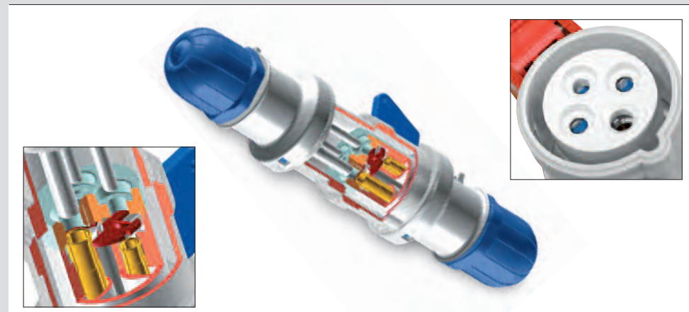
Connector tube protective shutter for greater safety against direct contacts. (The SAFE-IN safety device).