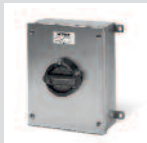
Stainless steel version