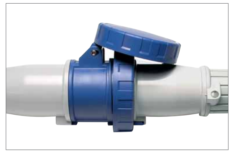
The performance connection