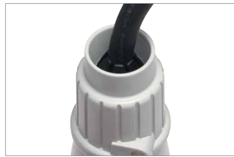
Watertight and cable grip safety