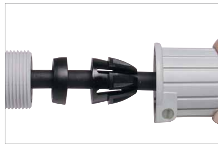
Simple cable clamping