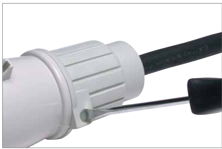
Unique and quick