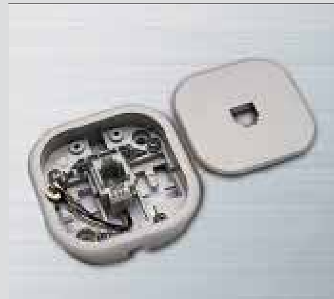
Surface and flush mounting RJ socket 6/4

For the qualified installer, Scame is offering a series of products that will satisfy most of the common needs both for wiring up and for expanding a telephone installation.