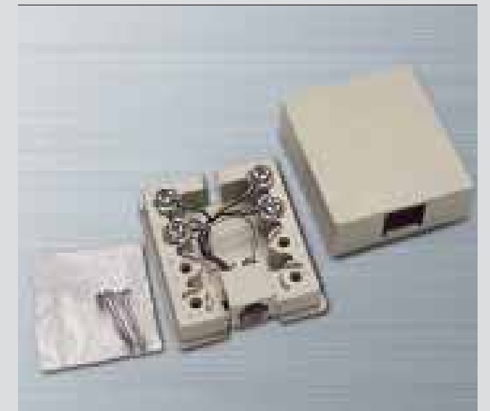
Surface mounting RJ Socket 6/4