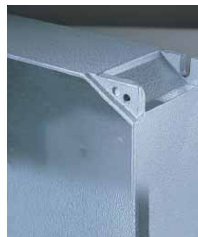
Fixing to wall by brackets incorporated in the enclosure base