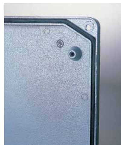
Holding seal in expanded EPDM, already mounted in place on the cover