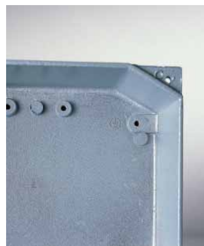
Enclosures and covers in aluminium alloy with blank walls and covered.